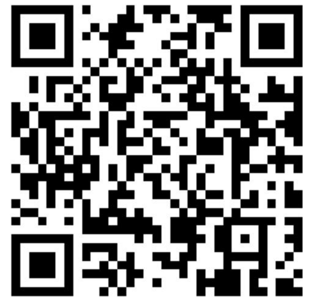
Official QR code