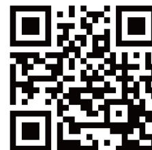
Official QR code

all has its domestic sales amount coming out at the top and some products have ready sale in Southeast Asia. Its products can be found in all